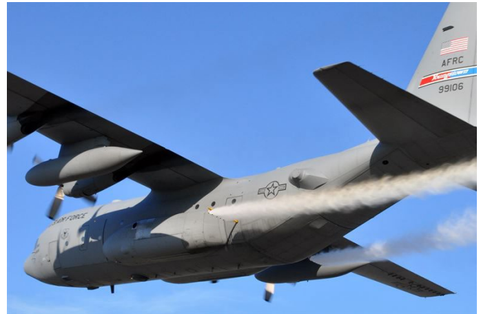
A Youngstown ARS modified C-130 Hercules aircraft simulates spraying pesticides during a field exercise

The 910 th AW is the host command at Youngstown ARS and is supported by multiple organizations under the Wing’s direct command authority. The 910 th AW mission is to “provide a current, qualified mission-ready force” with a supporting vision to “provide unrivaled tactical airlift, aerial spray and agile combat support - always ready to answer our nation’s call”. In wartime, the 910 th AW mission is to employ the C-130 Hercules aircraft in combat tactical airlift operations. These operations include low-level infiltration into a combat environment, where aircrews can deliver personnel and materials by airdrop and air-land techniques.