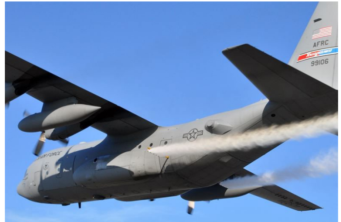
A Youngstown ARS modified C-130 Hercules aircraft simulates spraying pesticides during a field exercise

The 910 th AW is the host command at Youngstown ARS and is supported by multiple organizations under the Wing’s direct command authority. The 910 th AW mission is to “provide a current, qualified mission-ready force” with a supporting vision to “provide unrivaled tactical airlift, aerial spray and agile combat support - always ready to answer our nation’s call”. In wartime, the 910 th AW mission is to employ the C-130 Hercules aircraft in combat tactical airlift operations. These operations include low-level infiltration into a combat environment, where aircrews can deliver personnel and materials by airdrop and air-land techniques.